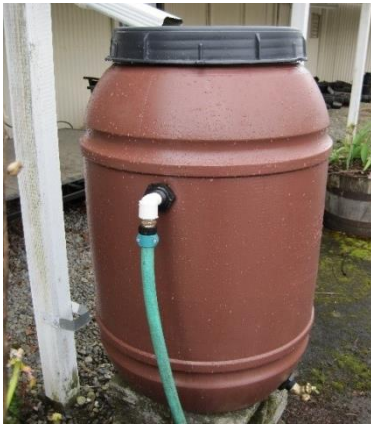
An example of a rain barrel

Rainfall catchment systems include rain barrels, tanks or cisterns and associated piping. These systems can be used to collect and temporarily store rainwater, reducing runoff flow from properties and providing an alternative to using drinking water for non-human consumption purposes.